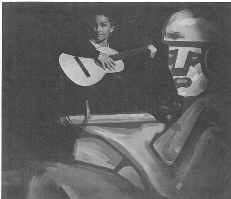
Performing one of my original songs on cultural history written for our Milwaukee Public Museum Television series, "Strange But True."

Determined to earn a doctorate in communications, I entered Case Western Reserve University in Cleveland to study television effects and found, much to my surprise as a concerned media professional, that by 1972 television toxicity had been well documented by the Surgeon General's report on television violence. 1 By ignoring the hard findings, by the "gatekeepers" not reporting the facts, the mass media successfully discounted and concealed the dangers of its own profession. That there was an already existing but ignored body of research on television effects caused the focus of my graduate work to shift, especially after I witnessed what could be called a worrisome unmonitored experiment in verbal versus non-verbal behavior.